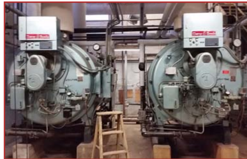
Elementary School boilers in need of replacement.