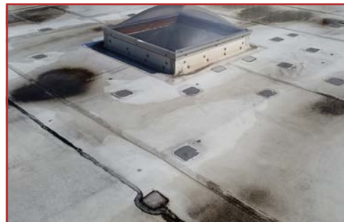
Roofs at the Junior/Senior High School in need of replacement.