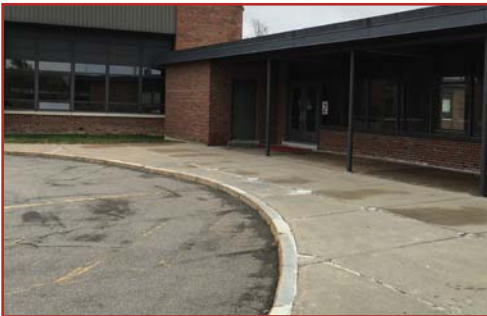
Sidewalks, curbs, and pavement at the Elementary School in need of replacement.