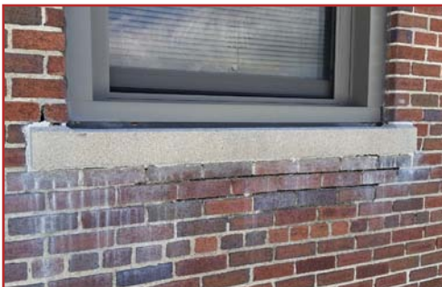
Masonry at the Elementary School in need of repointing.