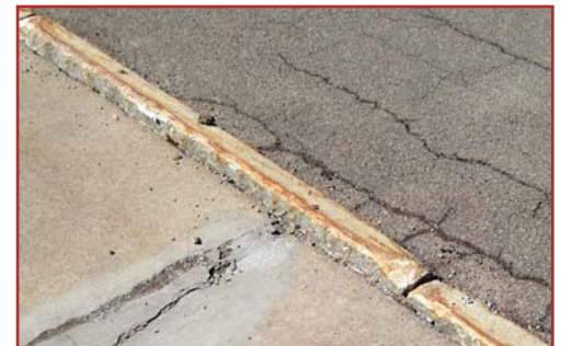
Sidewalks, curbs, and pavement at the Junior/Senior High School in need of replacement.